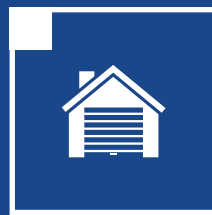
Brace Garage Doors