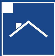
Install Roof Clips